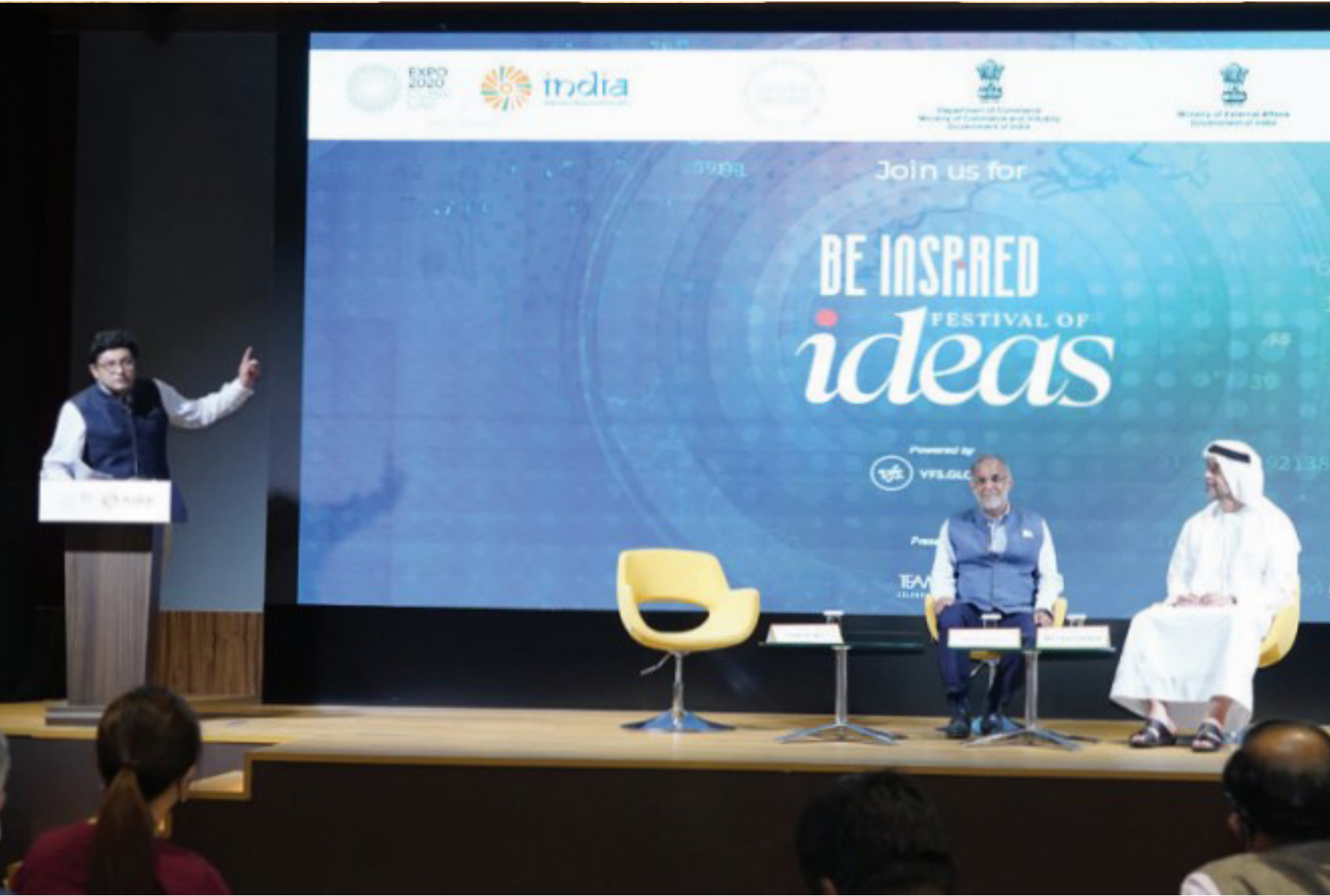
'Be Inspired' : Inaugural Session of the Festival of Ideas