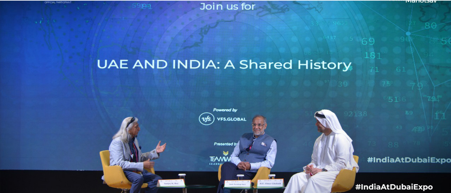
'Be Inspired' : Inaugural Session of the Festival of Ideas