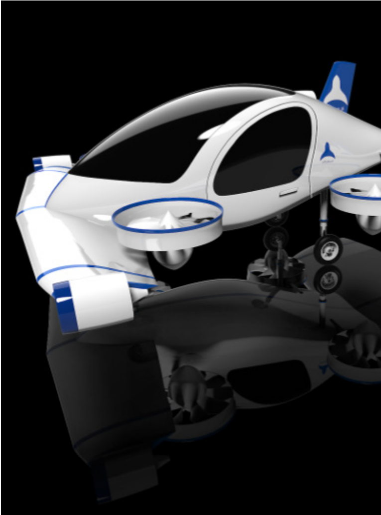
e-Plane Company At India Innovation Hub

flexible and on-demand travel. The larger vision for us is to alleviate traffic congestion in cities and offer safe, sustainable and affordable flying taxi experiences to consumers globally.